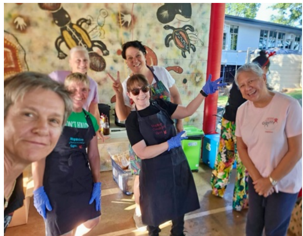
Photo: Smiles, teamwork, and plenty of ‘Festive Franks’ – our amazing gym members bringing the Christmas cheer while raising funds for the club! 🎄 🌭